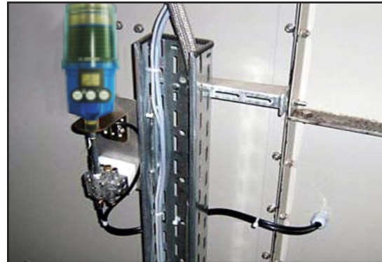
Chesterton Lubri-Cup™ EM with 2-point installation Kit and Chesterton 615 HTG #1.