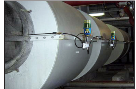
All 17 fans now run trouble free.